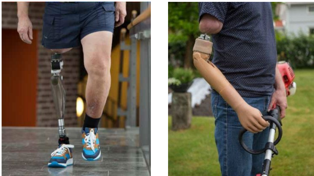
Figure 2. Left: Transfemoral OPRA™ Implant System depicting prosthetic components, Axor II. Right: Transhumeral OPRA™ Implant System depicting prosthetic components, Attachment Device and Puck.

The Abutment is connected to an artificial limb such as a prosthetic leg, arm, or digit through various prosthetic components, depending on the amputation level. The prosthetic components could include attachment, alignment, and load-control functions which protect the implant from accidental loads.